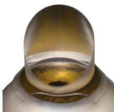
Photo represents image of a model eye.