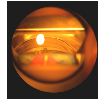
Incorrect view...Lens is tilted